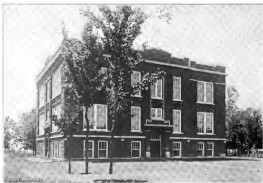
HIGH SCHOOL, THOMPSON